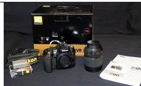
Nikon D90 and accessories