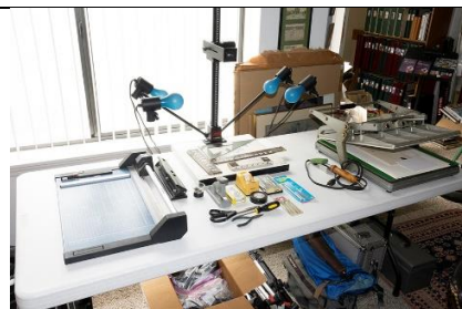
Copy stand and accessories